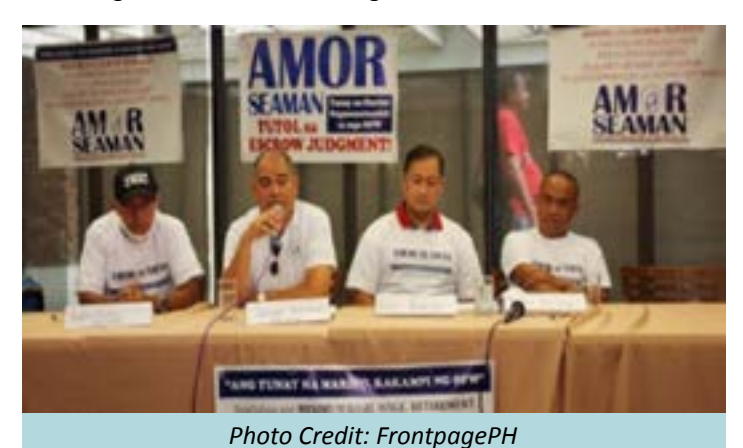
Groups not in favor of the escrow provision Labor groups: Escrow provision condemns our seafarers to years of legal Battles

Several groups have protested the escrow provision of the proposed Magna Carta of Filipino Seafarers, raising these issues: (1) Delayed Compensation for victims of maritime-work related injuries; (2) Discrimination against seafarers, violative of the equal protection clause of the Constitution; and (3) The provision discourages the solicitation of legal services.