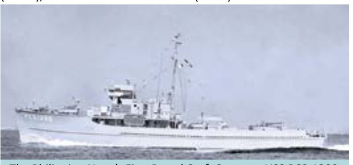
The Philippine Navy's First Patrol Craft Sweeper USS PCS-1399, later renamed RPS Tarlac (P-11).

The birth of Filipino Minewarfare Capability came after the reactivation of the Offshore Patrol (OSP) in 1945 with the formation of its major units namely the Patrol Force comprising our (Patrol Craft Escorts-Miguel Malvar Class), the Service Squadron composed of the First 5 out of 23 Landing Ship Tanks (LSTs), 16 Submarine Chasers of Anti-Submarine Warfare Force (ASWF), and the Minewarfare Force (MWF).