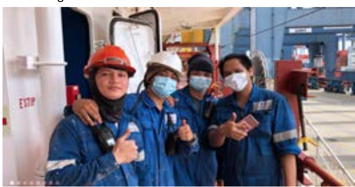
You can access the full report at Mission to Seafarers