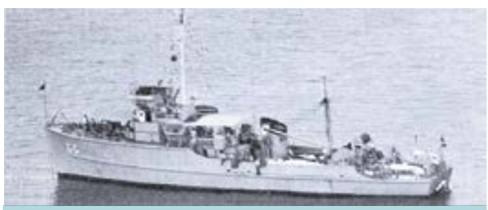
RPS Zambales (PM-55) sister ship of RPS Zamboanga Del Norte (PM-56) both acquired during the Magsaysay Administration.

Both ships were armed with 1-3inch/50 Gun, 1x20mm Gun, Hedgehogs, and 2 Depth Charge Racks. They served the country for 21 years before they were decommissioned and scrapped in 1969.