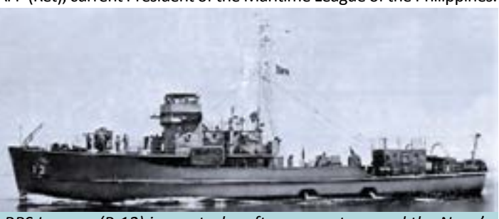
RPS Laguna (P-12) is a patrol craft sweeper type and the Navy's first minewarfare vessel along with her sister ship RPS Tarlac (P-11).