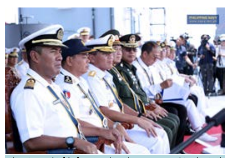
The ASEAN Chiefs' of Navies aboard BRP Davao Del Sur (LD602) during the AFR at Subic, Zambales.

The Sea Phase was also participated by the aforementioned nine ships and centered on a notional scenario carried out to harness cooperation and interoperability between participating navies.