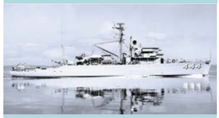
RPS Davao del Sur (PM-92) formerly the USS Firm (MSO-444) Photograph Courtesy the U.S. Navy.

CONCLUSION. In the 5-year AFP Modernization Plan from 1977-1981, envisioned was the acquisition of 2 Ocean/Coastal type Minesweepers and 1 Minelayer, probably to replace the Aggressive Class.