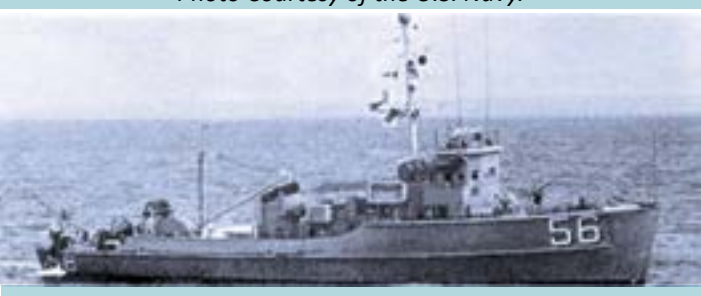
RPS Zamboanga del Norte (PM-56) was the Navy's 4th minewarfare vessel acquired under the U.S. Military Assistance Plan.

COLD WAR TURNED HOT. As the Cold War turned hot during those years, Minesweeping and Anti-Submarine Warfare became the Philippine Navy's core capabilities as entrusted to us by our allies should a regional conflict erupt. We would need to keep the sea lines of communication open by initiating minesweeping and minelaying, conduct anti-submarine missions in our geographical areas, and support our allies.