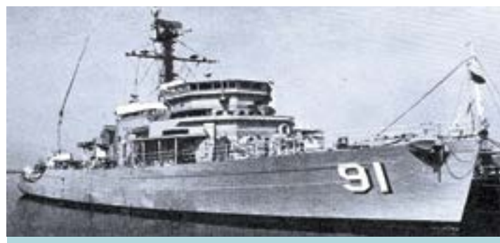
RPS Davao del Norte (PM-91) is one of the two Aggressive Class minesweepers of the Navy capable of long-range operations.