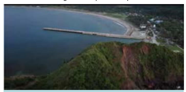
Claveria Port, Masbate.

Other than the increased number of completed projects and high budget utilization rate, the PPA also recorded a 3.23% decrease or Php142.52M less in total expenditures as compared to that incurred during the same period last year.