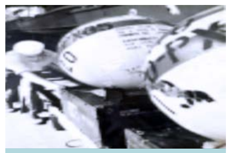
An enlisted personnel of a Philippine Navy warship secures mines during a SEATO Naval Exercise Circa 70's.

Naval mines are vital components of area denial strategy against the enemy. What if Lamon Bay had a minefield since 1952? or the passage between Coron Island and Linapacan Island in Northern Palawan; or the waters of Sulu and Balabac where various submarine sightings were made during the Cold War period? Having the capability to lay and sweep mines as an Island Nation is a vital factor in our territorial defense.