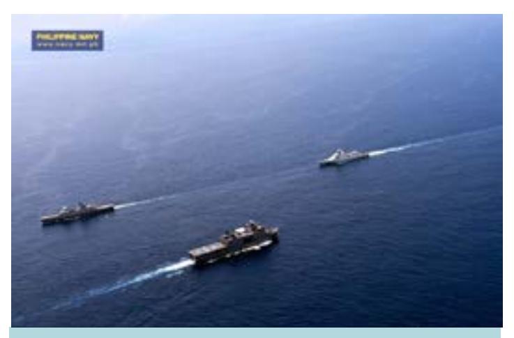
BRP Davao del Sur (center) passes RSS Supreme of the Republic of Singapore Navy (left) and KRI GNR 332 (right) of the Indonesian Navy during the ASEAN Fleet Review.